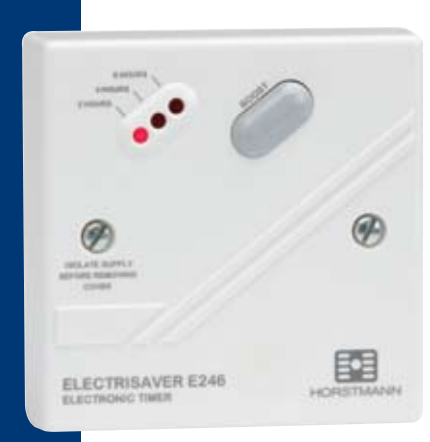
Choose from 2, 4 or 6 hour durations