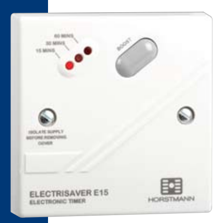
Choose from 15, 30 or 60 minute durations